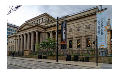
Manchester Art Gallery One of the country's finest art collections in spectacular Victorian and contemporary surroundings.

There are many fantastic museums in Manchester's City Centre. All of which are free to enter so you can explore the city's art and culture at your own leisure. All the museums are either within walking distance of the main Convention venue or easily accessible by public transport.