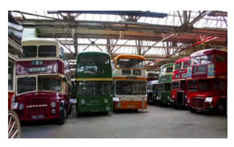
Museum of Transport You will find yourself transported to an age when all the local authorities around Manchester ran their own buses.