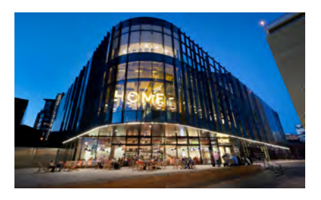
HOME From gallery to screen via café bar and bookshop, HOME redefines the contemporary arts centre.