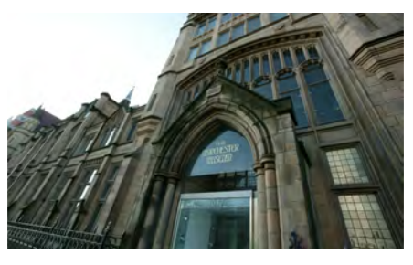
Manchester Museum 4 floors of displays and exhibitions in 15 galleries, featuring collections from all over the world.