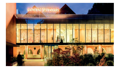
Whitworth Art Gallery An art garden by Sarah Price, sculpture terrace and orchard garden, landscape gallery and a café.